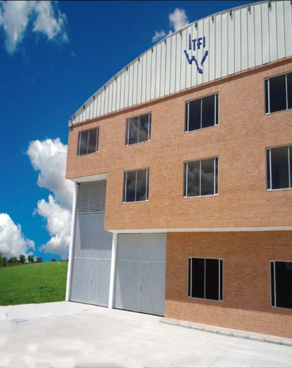
➤ TFI Shop/Warehouse in COLOMBIA