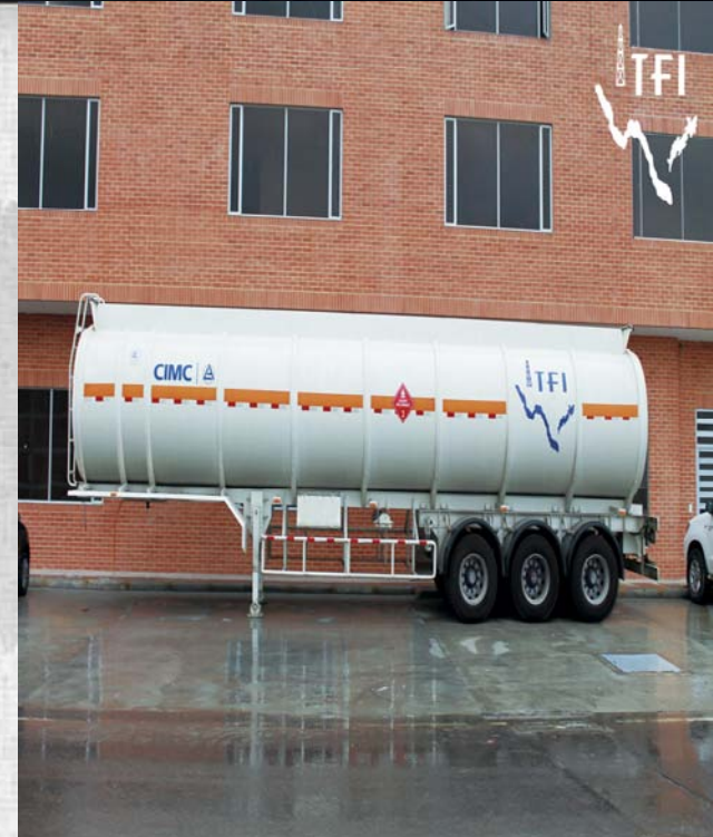
➤ TFI Transport oil tank