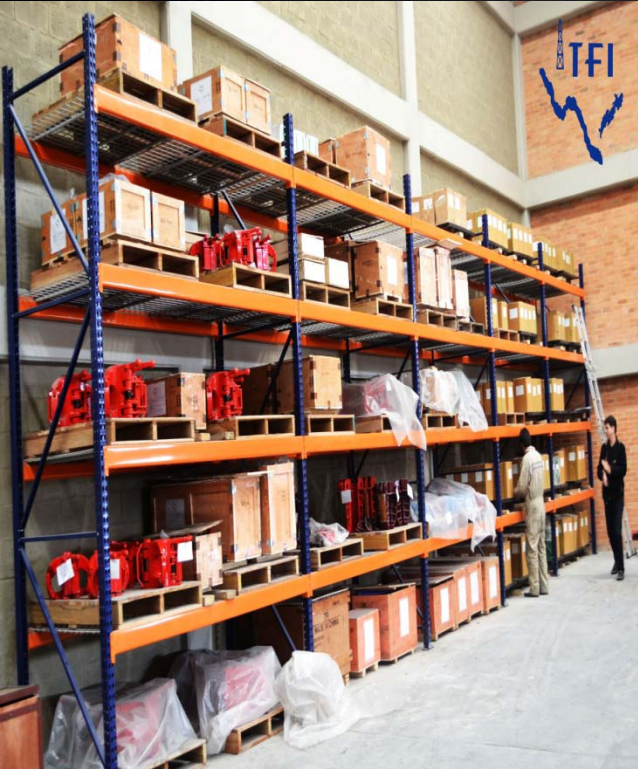
➤ TFI Warehouse in COLOMBIA