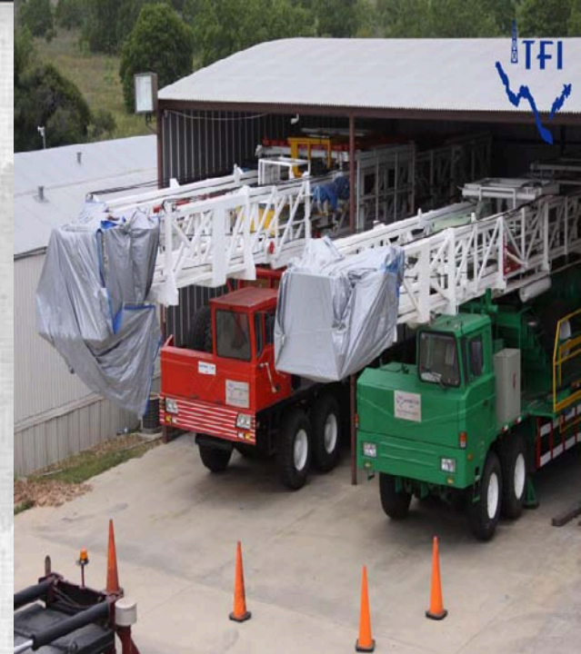
➤ TFI Mustang Rigs