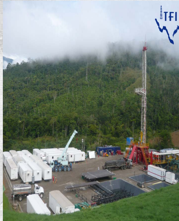
➤ TFI Rig site