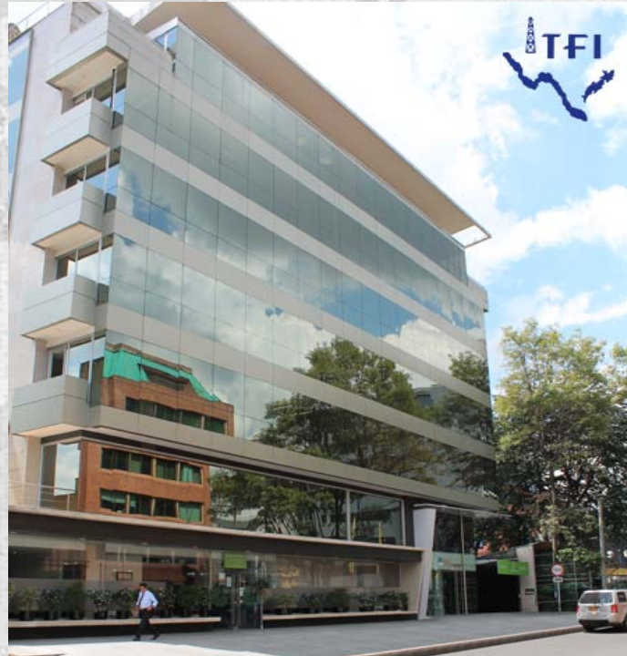
➤ TFI Office in BOGOTA